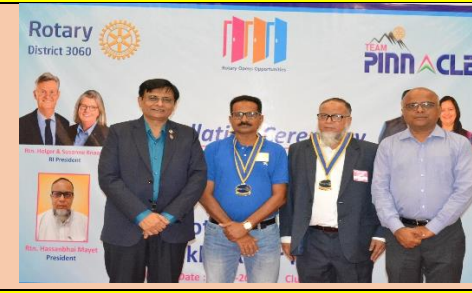
WITH DG AND IPP