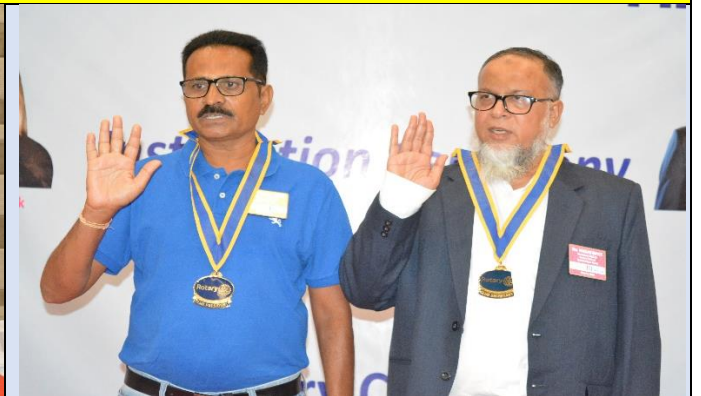
SWEARING – IN CEREMONY