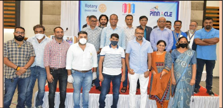
THE NEW COMMITTEE MEMBERS OF ROTARY CLUB OF CHIKHLI RIVER FRONT