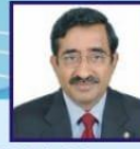
PDG Raju Subramaniam RRFC